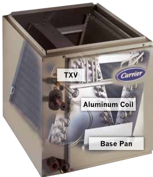
Model CNPVP Shown