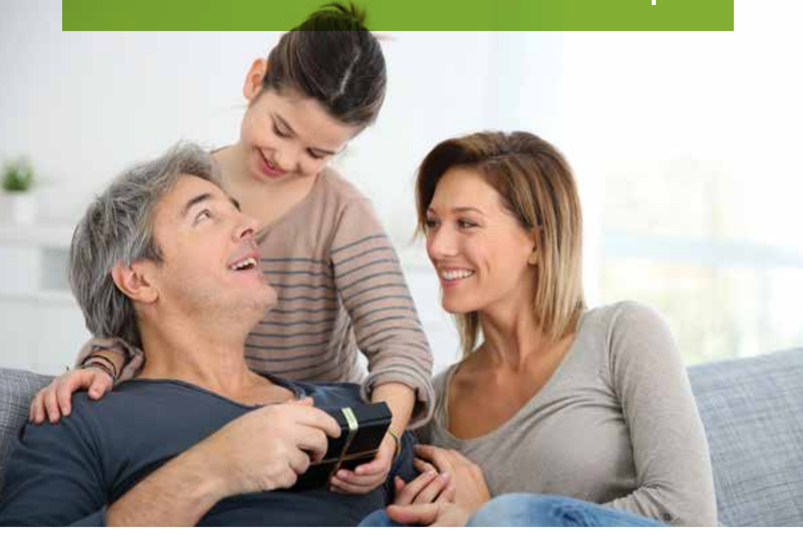
Enhanced comfort, up to 17.5 SEER/up to 9.5 HSPF rating